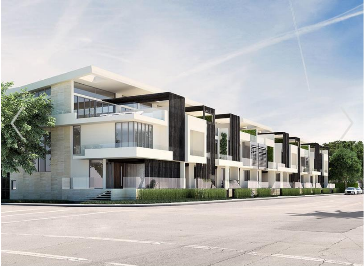
The 11-house Eleven on Lenox is located at 1030 15th Street in Miami Beach. Completion is slated for 2018. SHOMA GROUP/ ZYSCOVICH ARCHITECTS