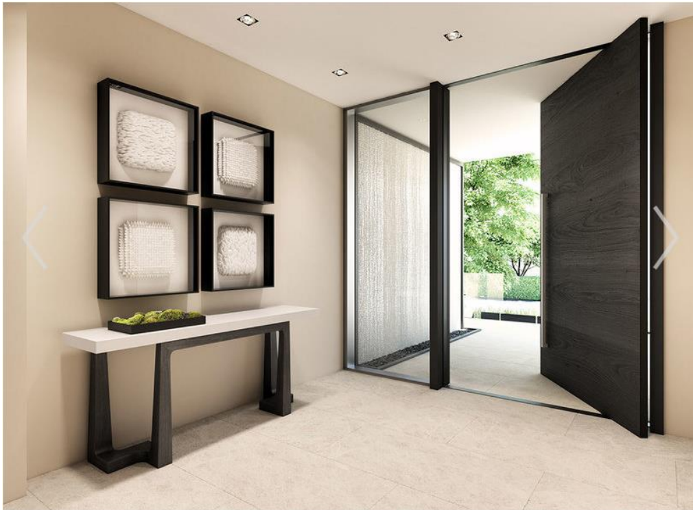
The units were designed by Zyscovich Architects and developed by Shoma Group. Above, a rendering of the entry foyer on the ground floor. SHOMA GROUP/ ZYSCOVICH ARCHITECTS