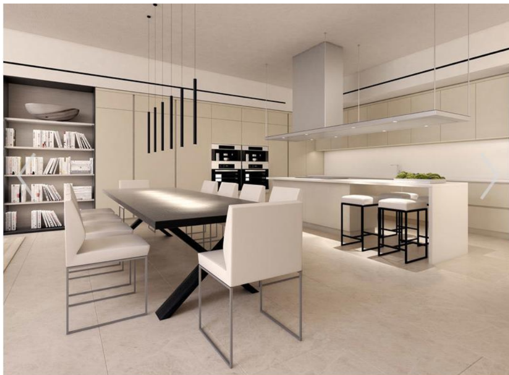
The Poliform kitchen with Gaggenau appliances and a smart lighting system that mimics the rhythm of day. It also includes a dining area. SHOMA GROUP/ ZYSCOVICH ARCHITECTS