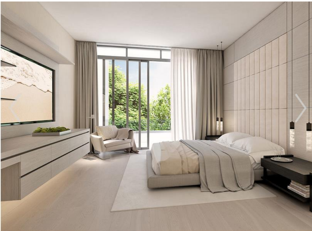
The master bedroom. SHOMA GROUP/ ZYSCOVICH ARCHITECTS