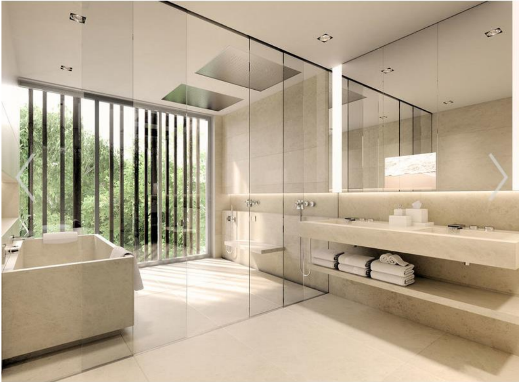
The custom Italian spa master bathroom. SHOMA GROUP/ ZYSCOVICH ARCHITECTS