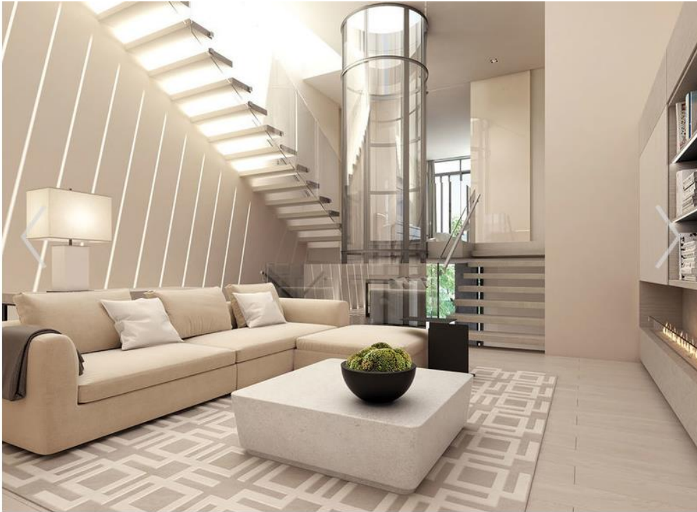
The family room on the second floor. Seen is also the elevator connecting all three levels. SHOMA GROUP/ ZYSCOVICH ARCHITECTS