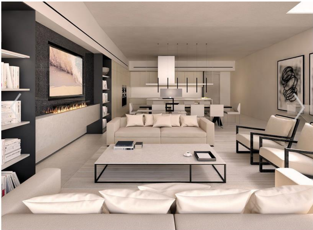
All interiors, featuring sand, stone and ceramic textures throughout, were envisioned by interior designer Charles Allem. Here, a rendering of the living area on the second floor. SHOMA GROUP/ ZYSCOVICH ARCHITECTS

Eleven on Lenox is slated for completion in 2018.